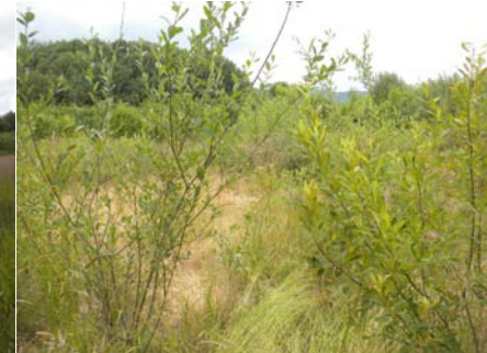
Photo 9 Willow area Southwest