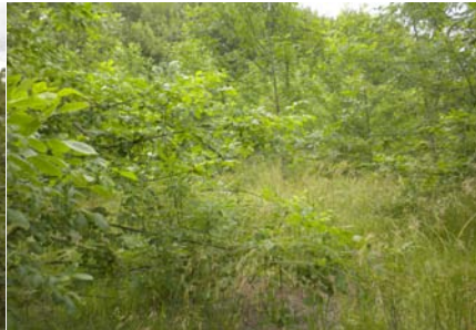
Photo 11 Ash area SW corner