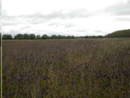
Photo 7 SW across swale