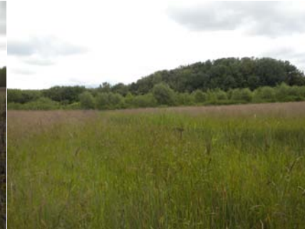
Photo 8 Willow area West