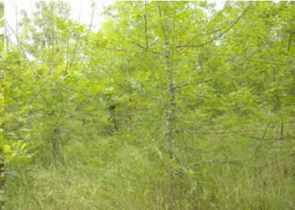
Photo 11 Ash area SW corner