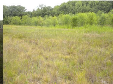
Photo 8 Willow area West