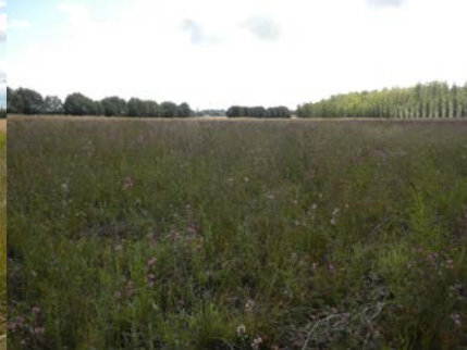
Photo 7 SW across swale