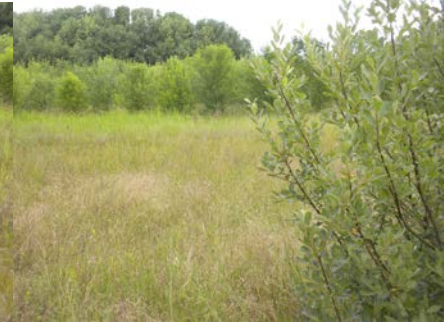
Photo 9 Willow area Southwest