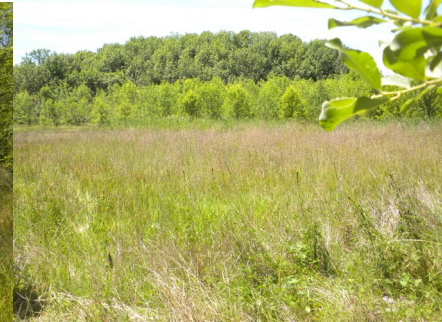
Photo 9 Willow area Southwest