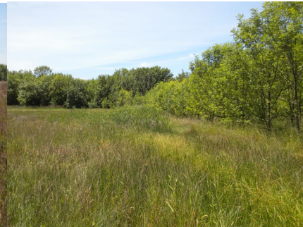
Photo 8 Willow area West