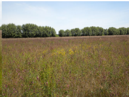
Photo 7 SW across swale