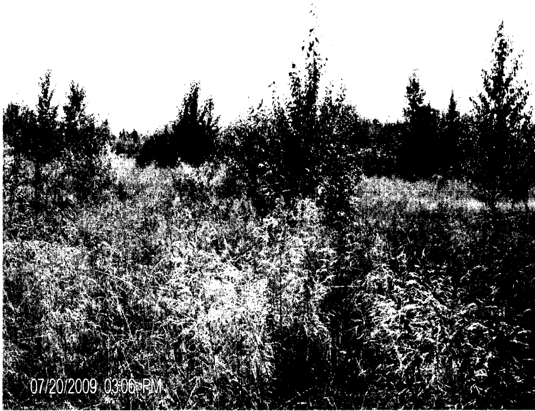
Figure 3 - Looking east to west