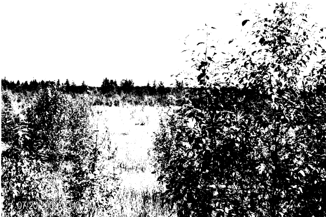
Figure 5 - Looking north to south