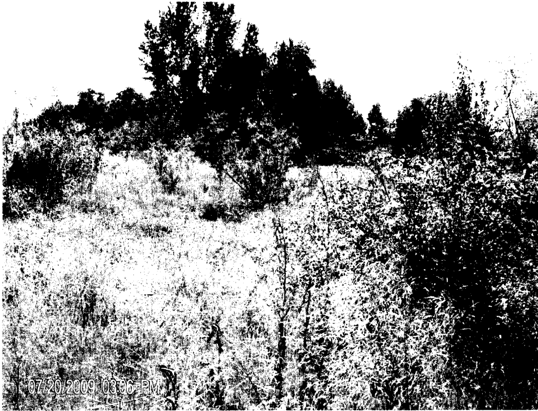
Figure 1 - Looking east to west