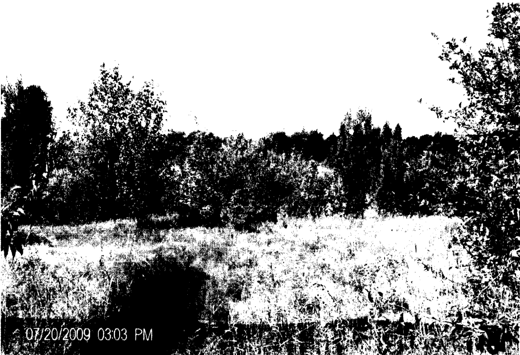
Figure 2 - Looking east to west