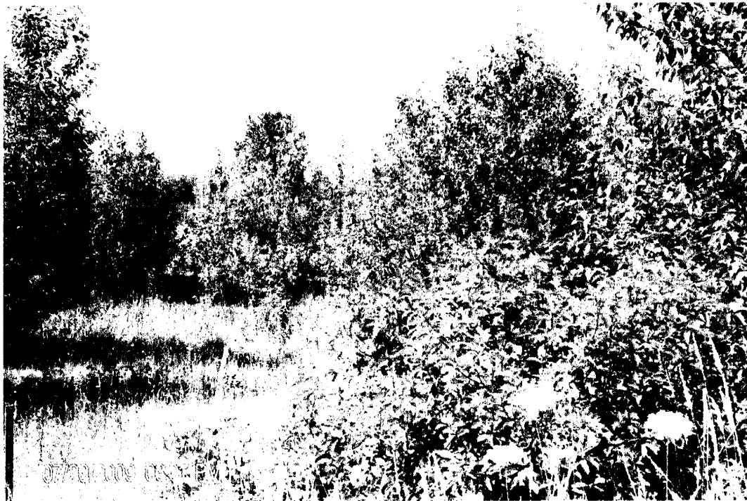
Figure 6 - Looking south to north